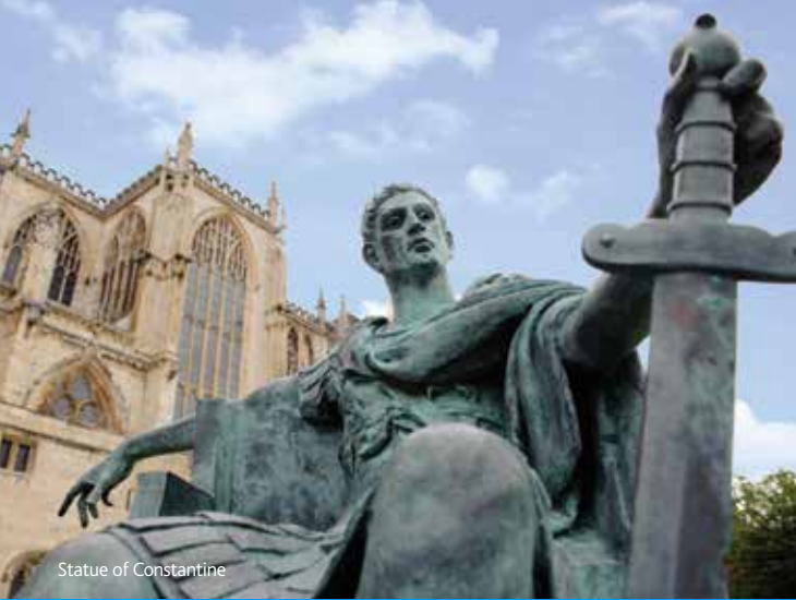
Statue of Constantine

Life in Roman York wasn't all Emperors and Empresses. What was life like day after day for the regular folk, both soldier and civilian, who lived right here nearly two thousand years ago? Find out as we walk in their footsteps. Where did they come from? What did they eat? Where did they live? How did they keep clean? And how, ultimately, were they laid to rest?