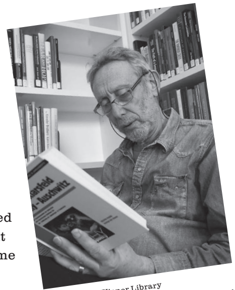
At the Wiener Library in 2018

Michael Rosen is most certainly one of the UK's best loved writers for young people and he has published over 140 books. Most children will be familiar with his books, whether it's the classic picture book We're Going on a Bear Hunt , his hugely popular poetry collections or classic retellings. A former Children's Laureate, Michael is an advocate and activist for children's books and reading. He was involved in setting up the Roald Dahl Funny Prize and the LOLLIES (Laugh Out Loud Awards). He is a broadcaster, presenting the language programme Word of Mouth on Radio 4. He is Professor of Children's Literature at the University of London, Goldsmiths College.