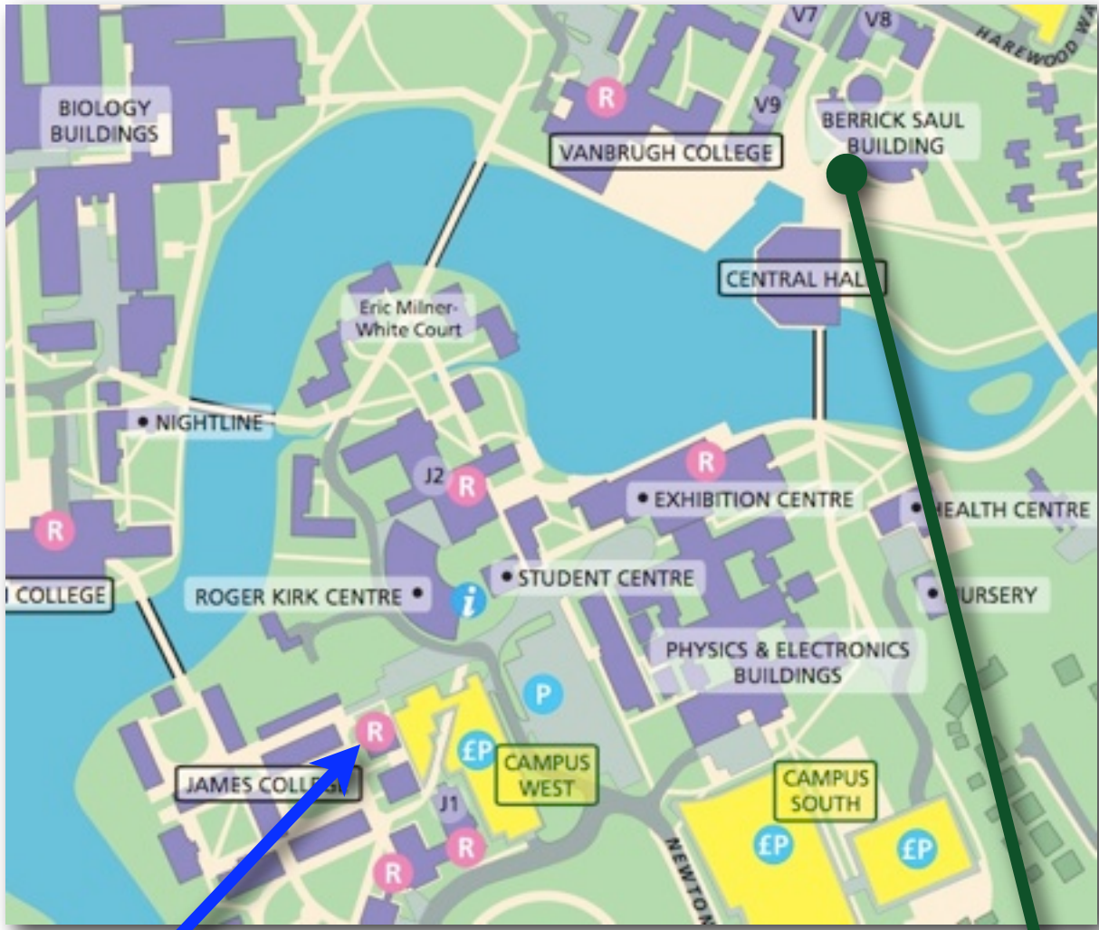
James College Reception